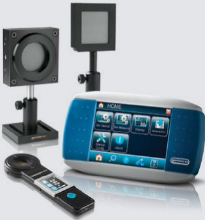
POWER & ENERGY METERS